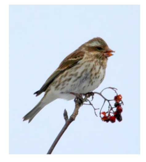
Pine Grosbeak 21